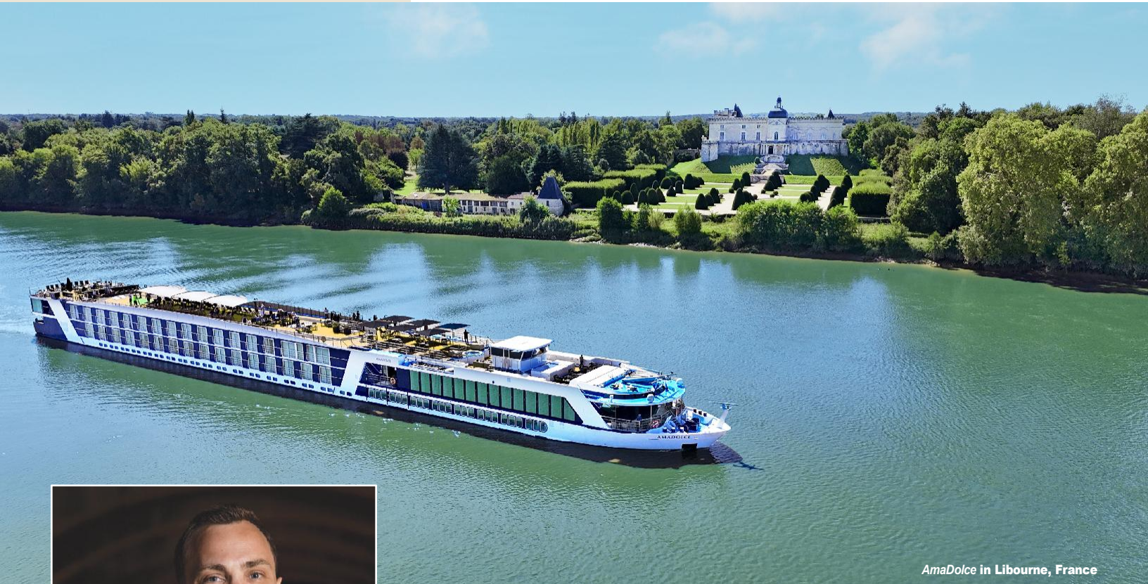
AmaDolce in Libourne, France

UNCORK LOCAL TRADITIONS, SAVOR INTENSE FLAVORS AND ENJOY PALATE-PLEASING ADVENTURES DURING AN AMAWATERWAYS WINE CRUISE