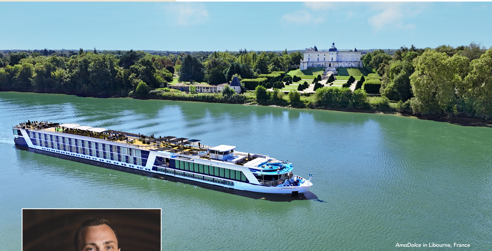
AmaDolce in Libourne, France