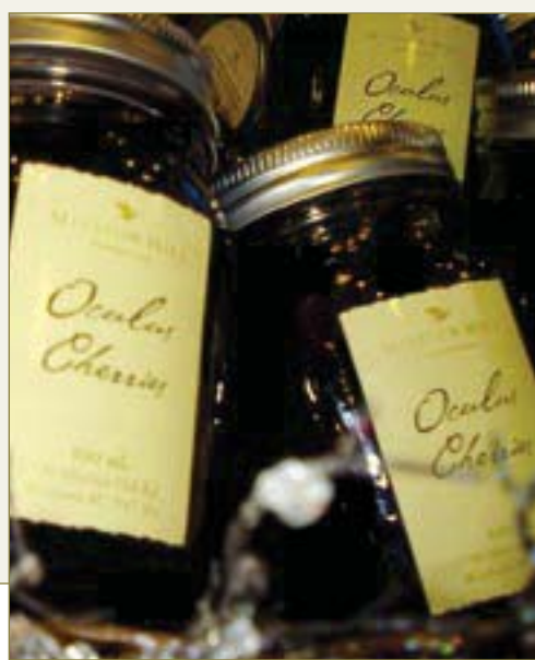
JARS OF OCULUS CHERRIES