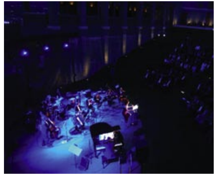
THE AMPHITHEATRE AT MISSION HILL FAMILY ESTATE

Special pre-concert dinner packages to celebrate the cultural festivities are available at the Terrace Restaurant, which offers guests breathtaking vistas of the vineyards and lake. Gourmet fare and Mission Hill’s award-winning wines will also be available. For more information please visit: www.missionhillwinery.com/reserveconcertseries